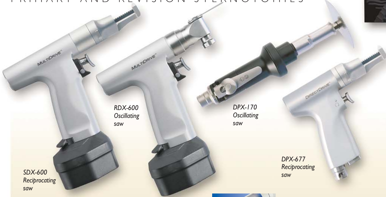
SDX-600 Reciprocating saw