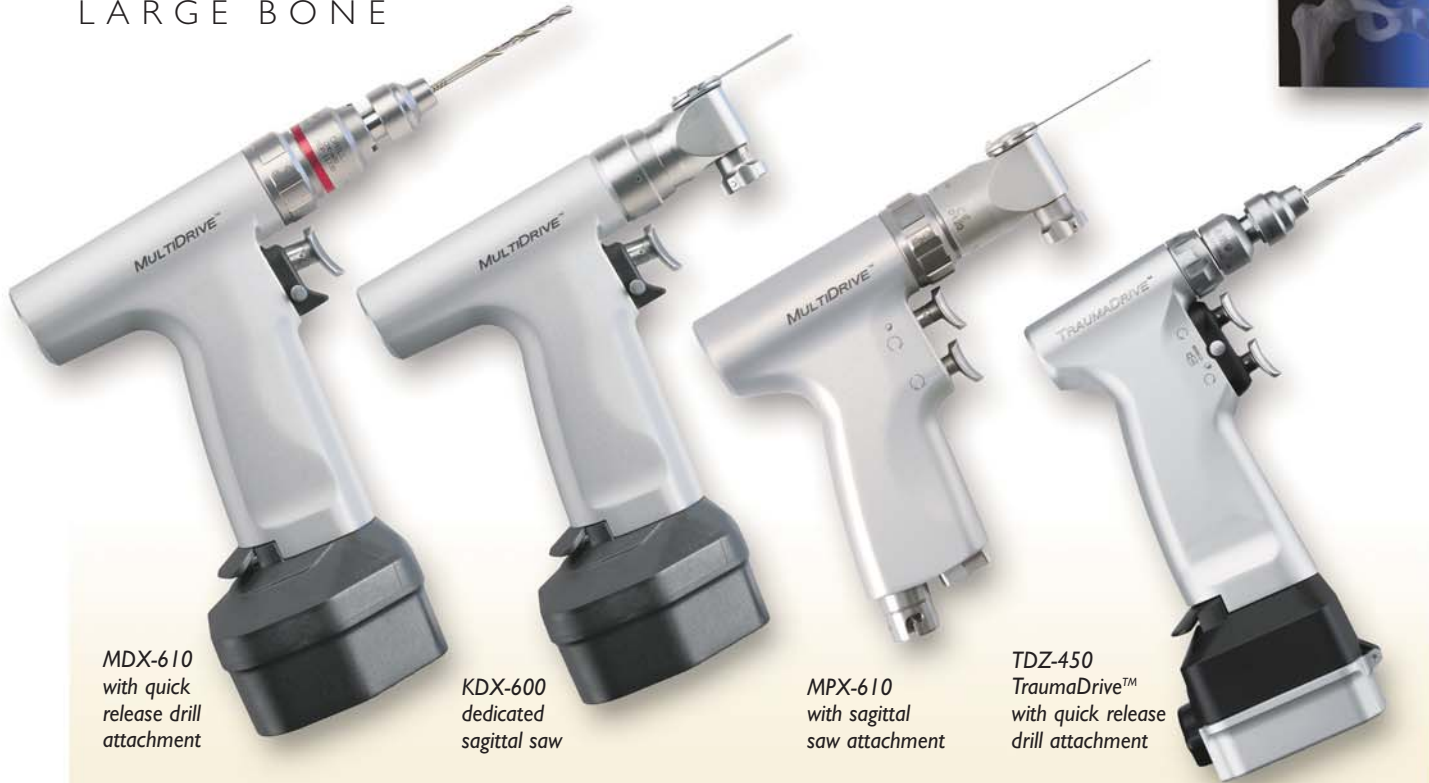
MDX-610 with quick release drill attachment