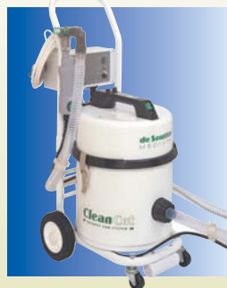
CNS3A Saw and extraction System