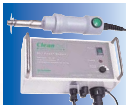
NS3A Saw and power module System