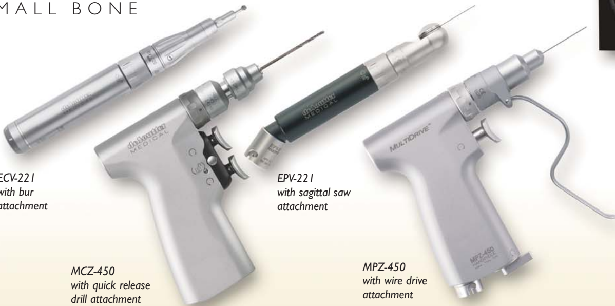
ECV-221 with bur attachment