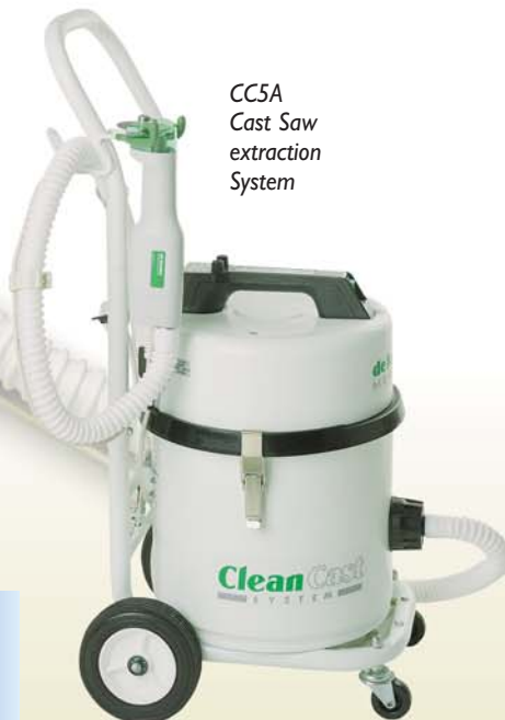
Ask for Cast Saw Catalogue No. 113