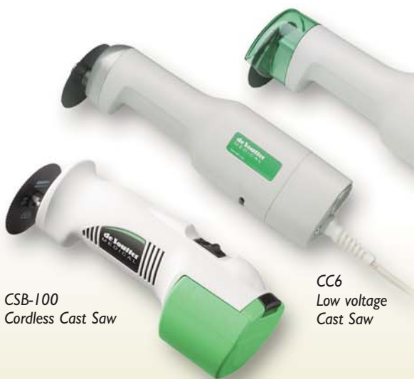
CSB-100 Cordless Cast Saw