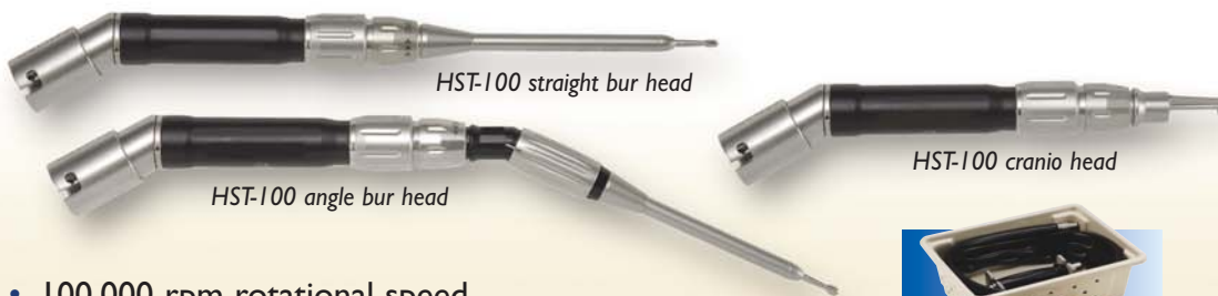
HST-100 straight bur head