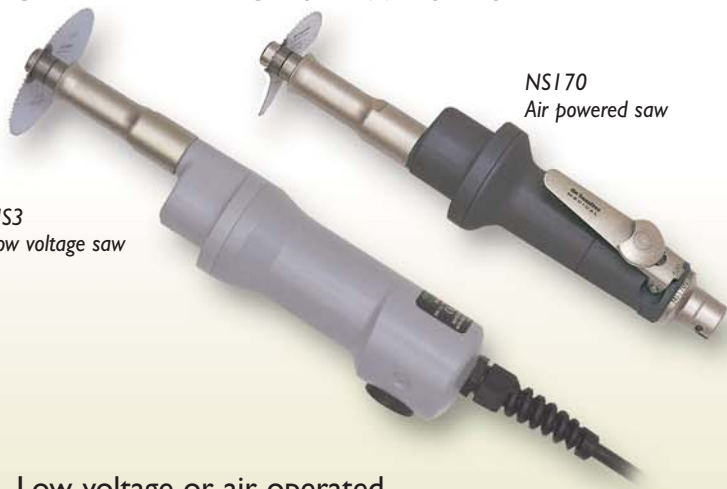
NS3 Low voltage saw